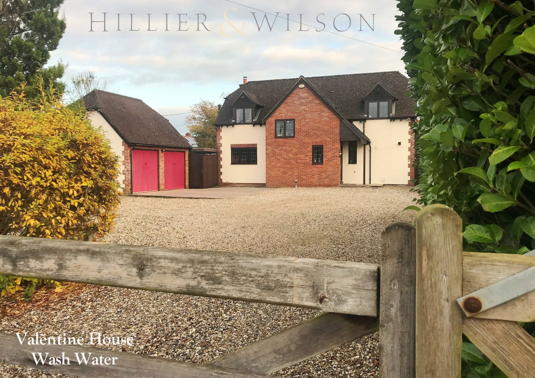
Valentine House Wash Water